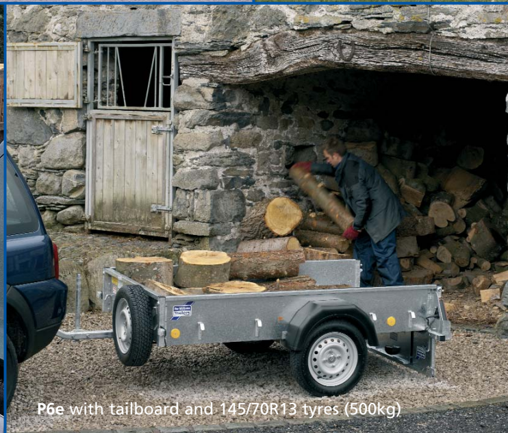
P6e with tailboard and 145/70R13 tyres (500kg)