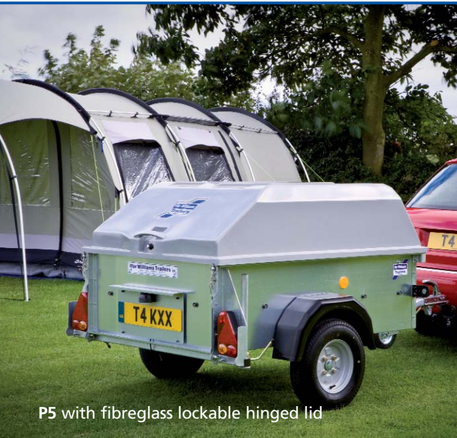
P5 with fibreglass lockable hinged lid