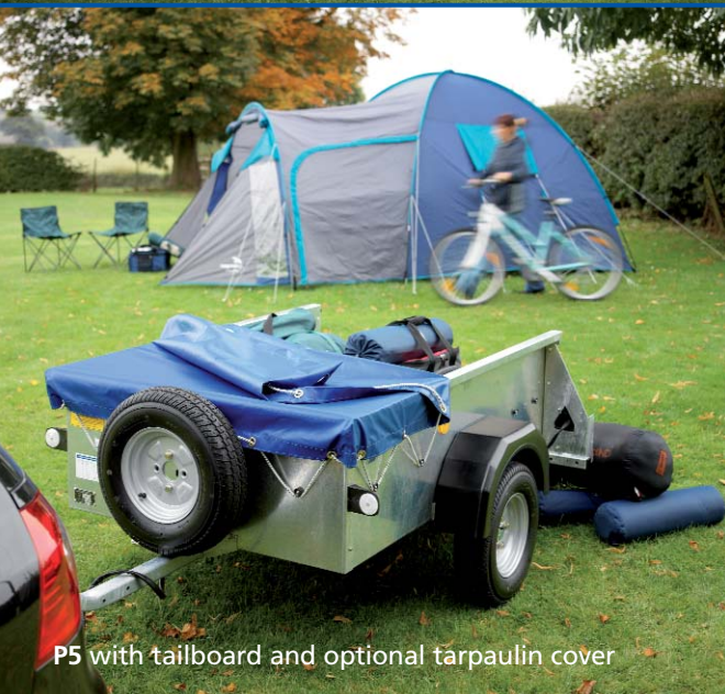
P5 with tailboard and optional tarpaulin cover