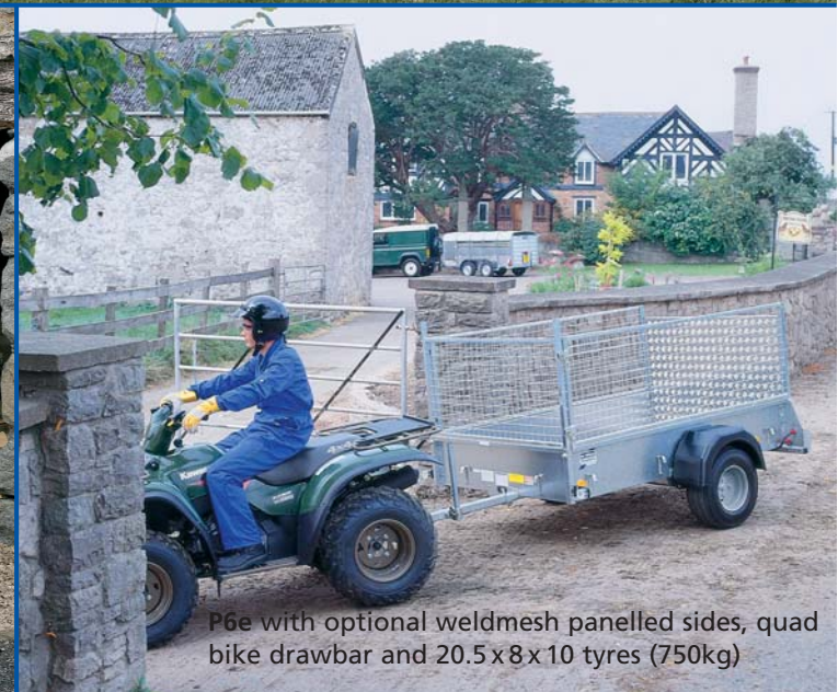
P6e with optional weldmesh panelled sides, quad bike drawbar and 20.5 x 8 x 10 tyres (750kg)