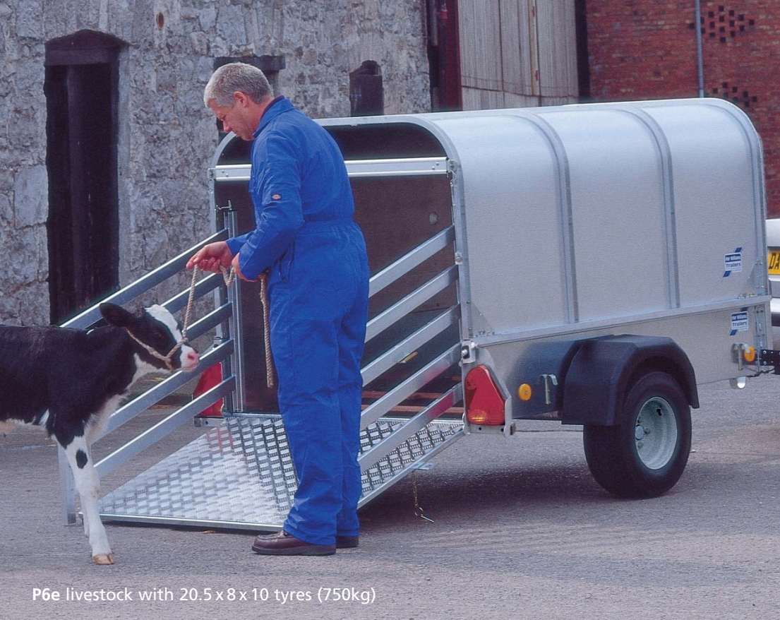
P6e livestock with 20.5 x 8 x 10 tyres (750kg)