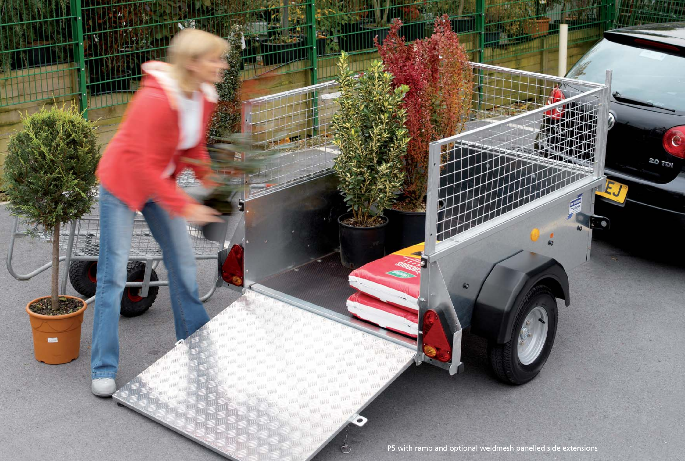
P5 with ramp and optional weldmesh panelled side extensions