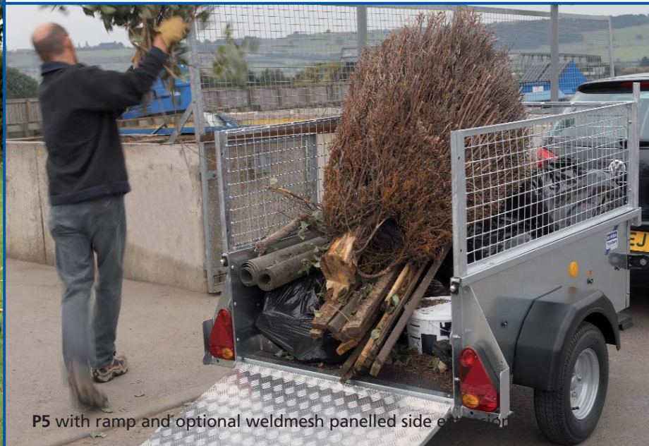
P5 with ramp and optional weldmesh panelled side

Diagrams above are shown with optional ladder rack (solid line) and with fibreglass hinged lid (dotted line)