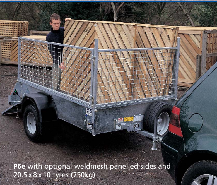
P6e with optional weldmesh panelled sides and 20.5 x 8 x 10 tyres (750kg)