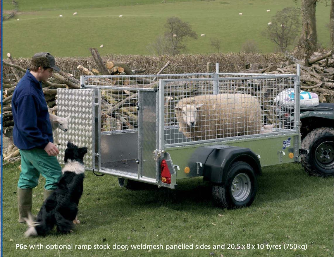
P6e with optional ramp stock door, weldmesh panelled sides and 20.5 x 8 x 10 tyres (750kg)